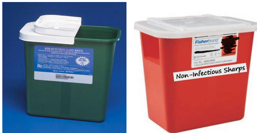
Figure 3 Non-infectious and non-biohazard sharps disposal containers